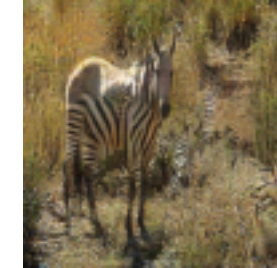
Q_{12}(w, f) \rightarrow P_{0.5}(w, f)